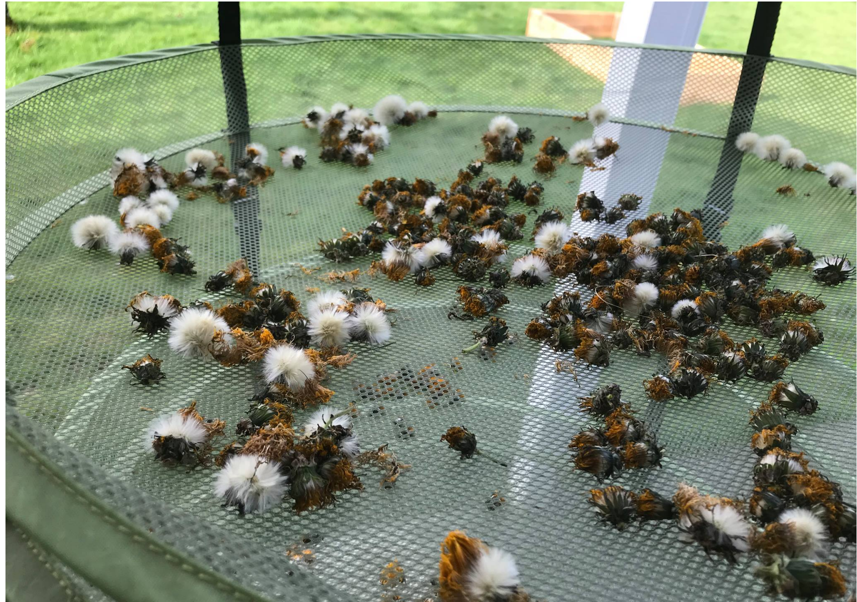
After Drying - Remove pollinated flowers or fluff before storing